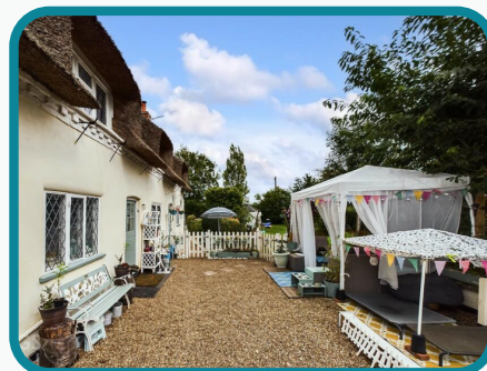
PuppyLove Island & Chill area

I always feed dogs under supervision and can separate if required. Iris, Davy and Dolly are fed around 0700h and then again at 1700h. You must supply your own food and treats and inform me of any special instructions or dietary needs (this should be completed on our Pawfile form). I can accommodate frozen raw diets only, but, because of space limitations, I will only take one dog on such a diet at a time. I provide regularly cleaned and sterilized feeding and drinking bowls and ensure there is clean and ample water available at all times.