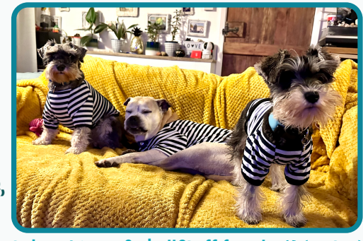
Host dogs: Iris, an AmbullStaff female, 14 (centre) Davy, a Mini Schnauzer male, 2, (left) Dolly, a Mini Schnauzer female, 1, (right)

Please arrive on time, and if you can't, please text to let me know when, so I can ensure any dogs here are relaxed and ready.